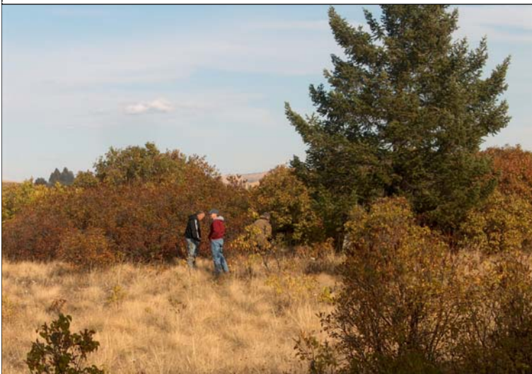
Here is a well kept pioneer Cemetery in Morrow Idaho. (Somewhere between Craigmont & Winchester)